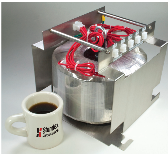
Toroidal transformer for medical imaging application

This toroidal transformer was designed to meet the demanding needs of medical imaging. Custom designed and manufactured specifically for a demanding application, this toroid includes value-added components such as connector harnesses and application-specific packaging and shielding.