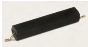
SMD packages for glass break detectors and metering applications