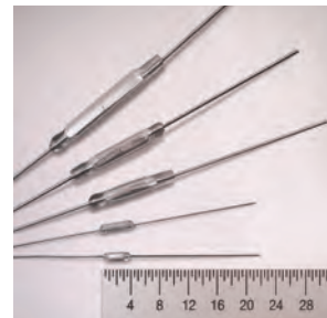
Reed Switches for a variety of Proximity & Fluid Level Sensing Applications