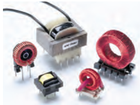
Custom components to fit any need