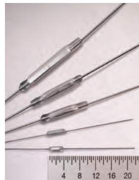
Magnetic reed switches as small as 3.7 mm, available in surface mount designs