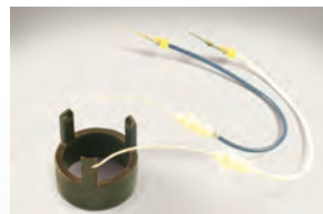
Voice coil for marine application