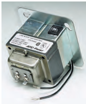
Low frequency magnetics with enclosures