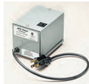
Cord connected class 2 transformer