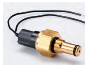
Pressure differential sensor