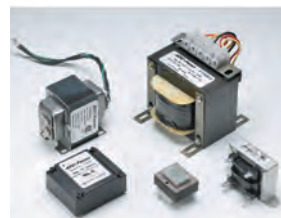
Custom laminated transformers